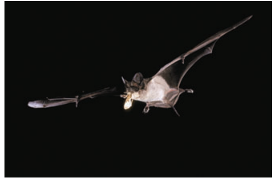
Figure 1. Brazilian free-tailed bat ( Tadarida brasiliensis ) flying with a moth in its mouth (photo by Merlin D. Tuttle, Bat Conservation International, www.batcon.org ).

Among the estimated 1,232 extant bat species, 8 over two thirds are either obligate or facultative insectivores (Table 1). They include species that glean insects from vegetation and water in cluttered forests to those that feed in open space above forests, grasslands, and agricultural landscapes (Fig. 1). Although popular literature commonly recognizes bats for their voracious appetites for nocturnal and crepuscular insects, 35 the degree to which they play a role in herbivorous arthropod suppression is not well documented. In this section, we review the available literature on the predator–prey interactions between