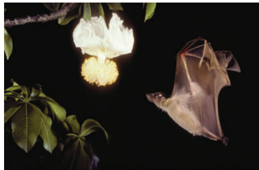
Figure 3. Wahlberg's epauletted fruit bat ( Epomophorus wahlbergi ) approaching a baobab flower of which it pollinates.

Unlike predation, which is an antagonistic population interaction, pollination and seed dispersal are mutualistic population interactions in which plants provide a nutritional reward (nectar, pollen, and fruit pulp) for a beneficial service: pollen and seed dispersal. Bats, along with many other flower-visiting and fruit-eating animals, provide important mobility for plant gametes and propagules. As a result, there has been extensive coevolution between plants and their pollinators and seed dispersers.