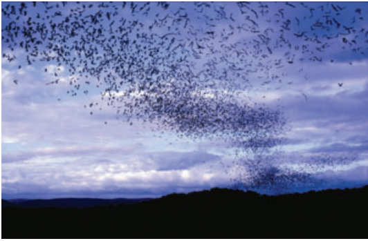
Figure 2. Brazilian free-tailed bats ( Tadarida brasiliensis ) dispersing over agricultural landscapes from a maternity roost in south-central Texas.

to better understand its ecosystem service. 62,66,99,100 Millions of Brazilian free-tailed bats migrate northward each year in the spring from Mexico to form enormous maternity colonies in limestone caves and bridges throughout the southwestern United States. 43,101 Each evening, large numbers of bats emerge from these roosts (Fig. 2) and disperse across natural and agricultural landscapes in high enough densities to be detected by NEXRAD WSR-88D Doppler weather radars. 99 As recently as the 1950s and early 1960s, midsummer colonies of Brazilian free-tailed bats in 17 caves in the southwestern United States were estimated to total about 150 million individuals. 102 However, recent estimates, based on improved census methods using thermal infrared imaging and computer detection and tracking algorithms, conclude that these same caves now house closer to nine million bats, indicating either a marked population decline or an overestimation in past observations. 103 The likelihood of historic overestimates is supported by further quantitative assessments of colony dynamics and emergence behavior of Brazilian free-tailed bats that roost in Carlsbad Caverns, New Mexico. 104