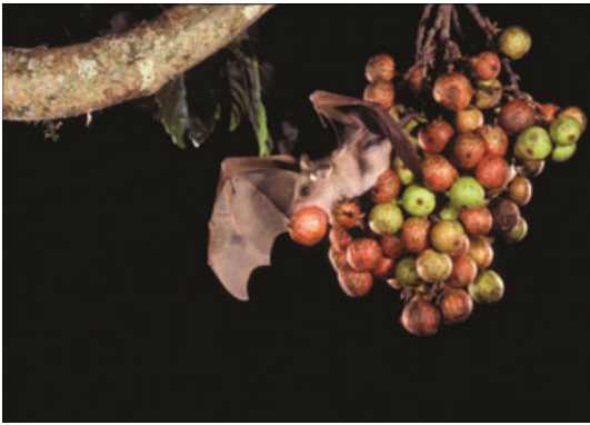
Figure 5. Gambian epauletted fruit bat ( Epomophorus gambianus ) taking flight after plucking a fig infructescence.

and Kress, 150 Fleming and Muchhala, 146 Fleming et al. , 145 Lobova et al. , 147 and Muscarella and Fleming. 151 Here, we discuss these interactions in terms of the ecosystem services that provide direct and indirect benefits to humans.