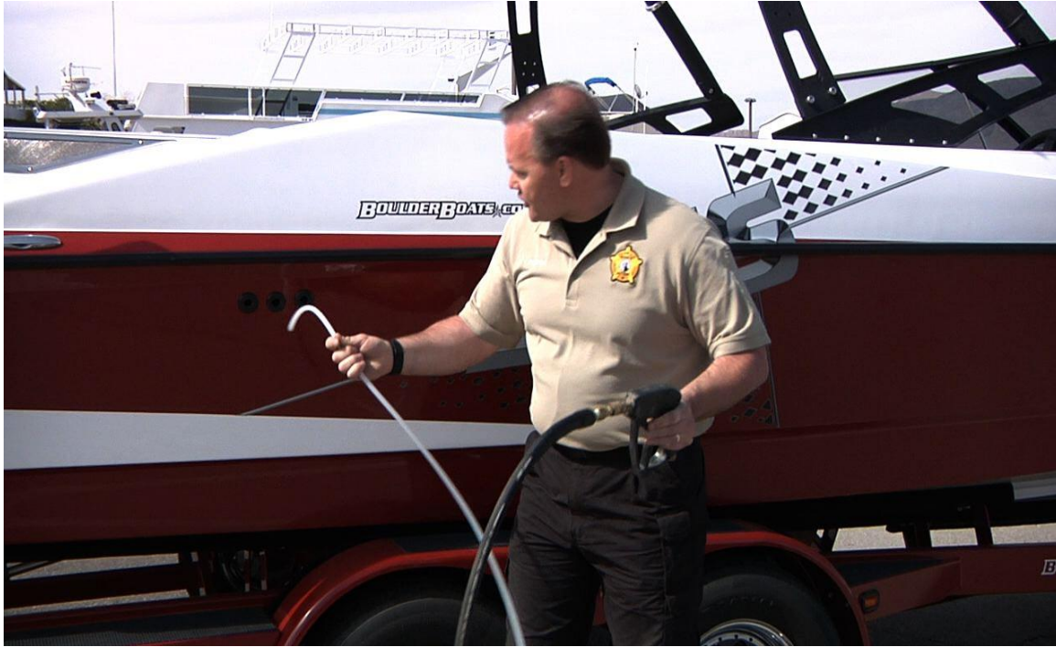
Using Hose Extension to Lower Hot Water Flush Temperature to 120 °F to Treat Ballast Tank