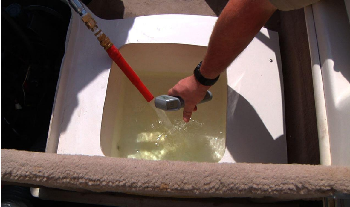
Flushing Live Well