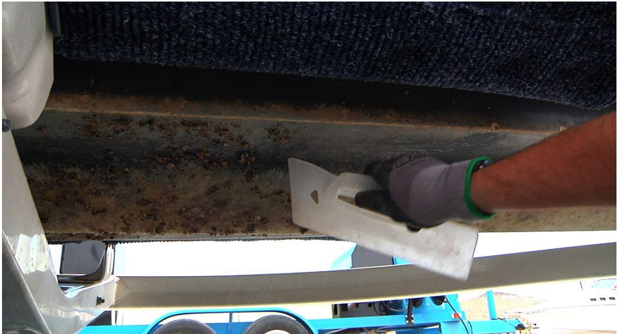
Removing Attached Mussels with Plastic Scraper Prior to Pressure Washing

Be sure to use a nozzle head that directs the water in a fan-like rather than a pinpoint spray. The shape of the spray as determined by the nozzle head used should be 2-3 inches wide eight inches out from the head to avoid any paint damage and allow a wider spray area of greater lethal contact time. We also recommend a 40-deg flat fan spray nozzle (anything less than 40° nozzle can cause damage to the surface) and a 12” standoff to get the maximum coverage and to prevent damage to the vessel.