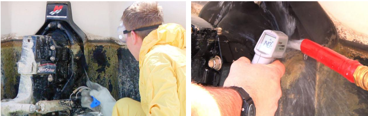
Using a Brush to Remove and Flushing Attachment to Kill Mussels in the Gimbal Area