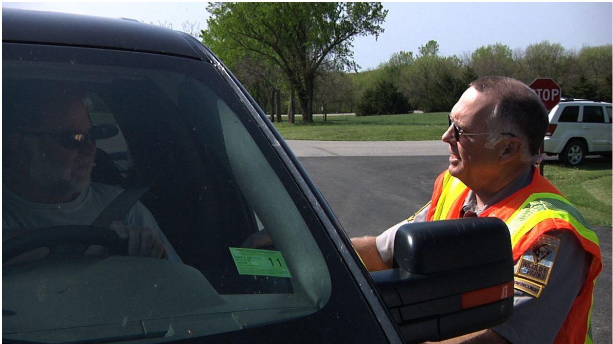
Screening Interview at Kansas Department of Wildlife, Parks and Tourism Check Station