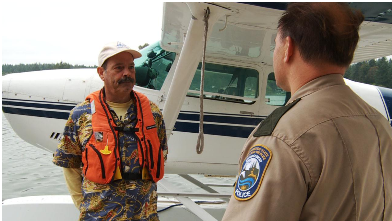
Screening Interview Prior to Inspecting Seaplane

While the primary focus of most water resource managers has been and will continue to be on the potential threat of AIS proliferation via the overland transport of watercraft and equipment, the seaplane pathway has been receiving more attention recently as significant progress is being made with other types of more traditional watercraft and equipment interdiction. As Dreissenid mussels and invasive aquatic plant species continue to spread throughout North America, individual jurisdictions with relatively high seaplane use are beginning to consider, and in some cases, implement, more aggressive regulation of this activity.