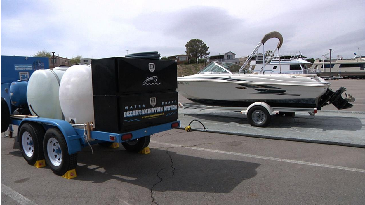
Portable Decontamination Unit Including Wastewater Containment Pad