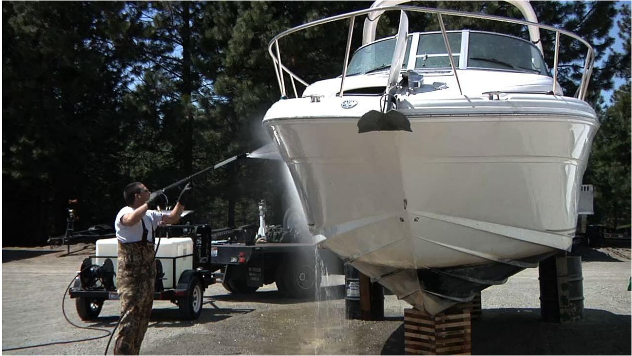
Decontamination of a Commercially Hauler Watercraft