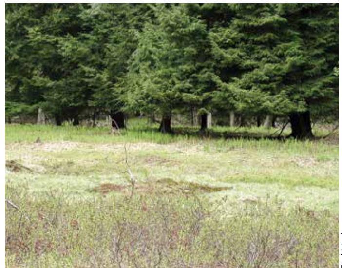
Forest regeneration inside versus outside a fence. Research demonstrates that high deer impact inhibits forest regeneration.