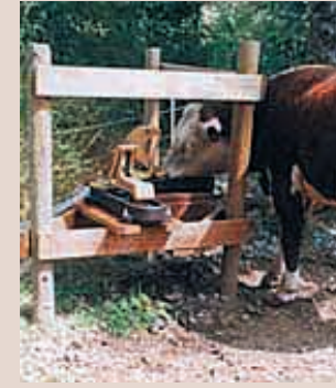
Alternative watering systems such as nose pumps help keep livestock out of streams.

Streamside plants help stabilize streambanks, moderate stream temperatures, and provide habitat for fish and other wildlife.