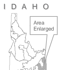
Figure 22. Overthrust Mountains habitats.