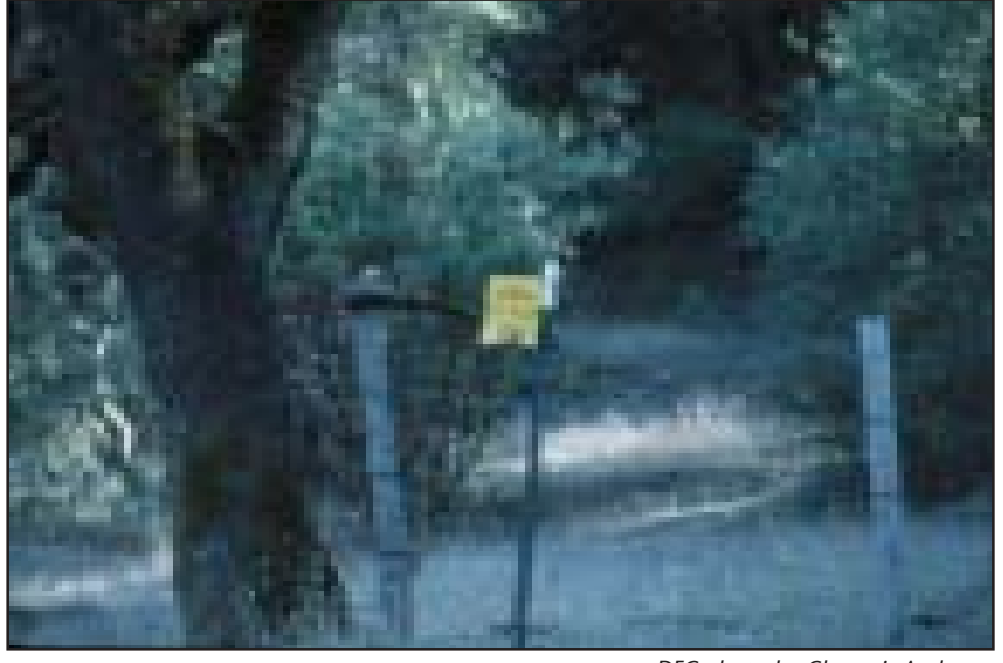
Posted signs indicate wildife area borders.