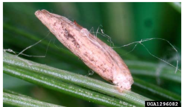
Figure 2. Larval case of larch casebearer.

Larch casebearer has one generation per year, and like all moths, has four life stages. Eggs are laid singly on the undersides of needles in late June or July depending on elevation and latitude. Larvae hatch in approximately two weeks, boring directly through the egg into the needle. Larvae feed exclusively inside the needle for approximately two months. Third instar larvae then make a protective case from a hollowed out needle, and line it with silk (Figure 2).