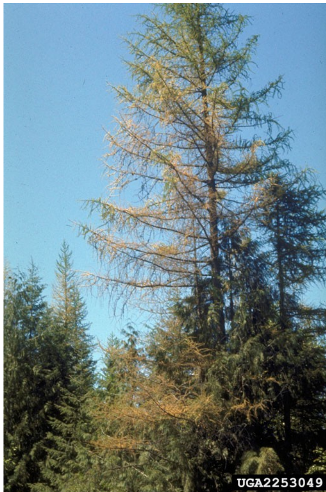
Figure 4. Foliage discoloration due to larch casebearer.

in the summer. Repeated, long term defoliation by the larch casebearer can cause growth reduction, branch dieback, top kill, and eventually death. Weakened trees are more likely to be attacked by borers or bark beetles.