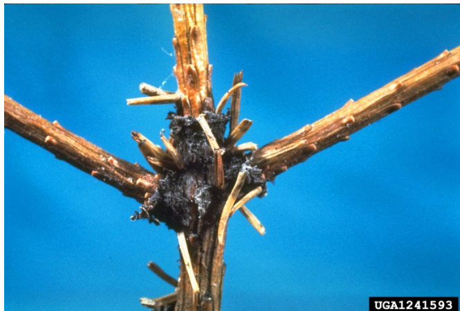
Figure 3. Third instar larvae overwintering.

In the spring, larvae molt to the fourth instar as the new needles develop, and continue to feed on the new growth. Pupation takes place within the case, and adults emerge in June or July.