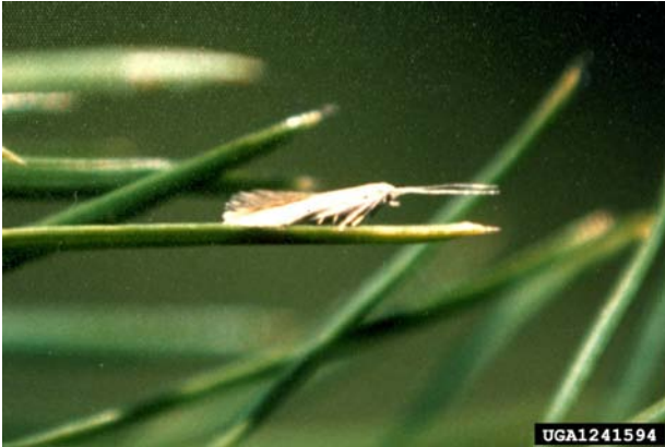
Figure 1. Larch casebearer adult.

The larch casebearer (Figure 1) is a pest of western larch in the Inland Northwest.