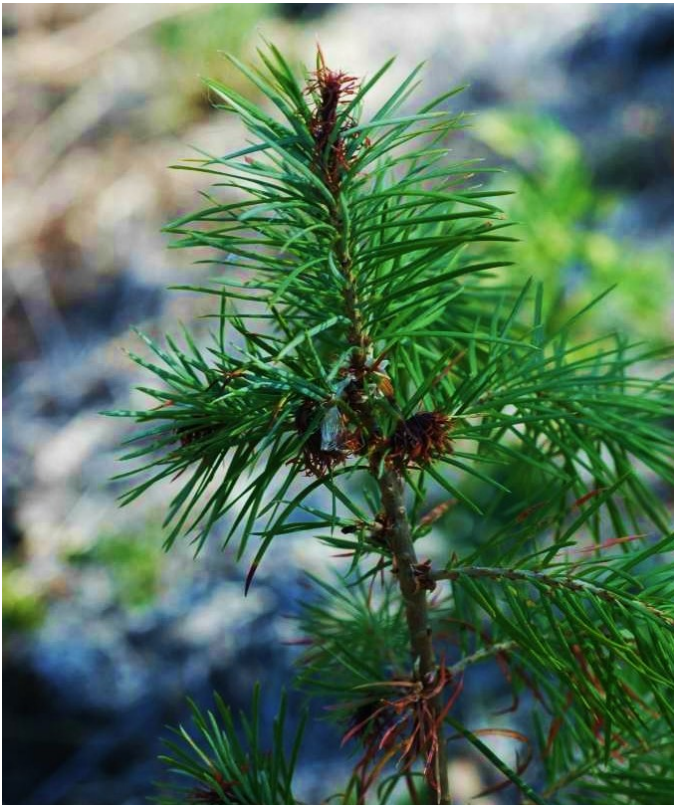
Figure 3. New growth on Douglas-fir killed by late spring frost.

Unusually cold weather following spring or fall planting can kill newly planted seedlings. In the spring this happens when frosts occur after the seedlings have lost dormancy and begun to grow. Sometimes only the new flush of growth is killed (Figure 3) but often the entire seedling dies. This