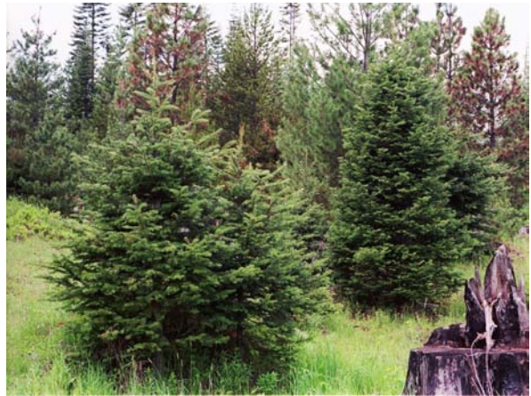
Figure 2. Grand fir shaped by repeated pruning by late spring frosts. Note the needle disease on the ponderosa pine in the background.

growth are severely reduced in the season following injury. Repeated injury of this type results in forked tops and trees with a shrub-like growth form. This is especially true for grand fir. The fullest and best-formed Christmas trees are found in areas where repeated frost injury has pruned the trees (Figure 2). Early fall frosts can also kill