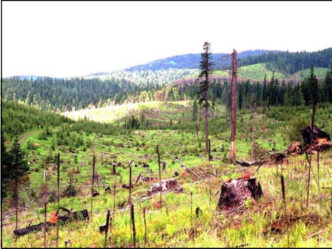
Figure 6. Frost pocket. Note the absence of seedlings in the draw bottom. Winter desiccation injury occurred on newly planted seedlings in the foreground.

or the shrub-like or bushy growth form of existing conifers are good indications of site with severe frost problems. The presence of conifer species such as subalpine fir, Engelmann spruce, and lodgepole pine that commonly occur on colder sites are also good indicators of frost problems that may occur after harvest. Removing an overstory of frost resistant species can expose advance regeneration of more susceptible species to injury. For example, grand fir often regenerates in the shade of lodgepole pine overstories on frost-prone sites. Cutting the overstory increases the probability of frost damage to the grand fir (figure 7).