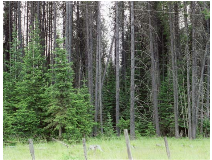
Figure 7. Frost susceptible grand fir regenerating under an overstory of lodgepole pine on a frost-prone site.