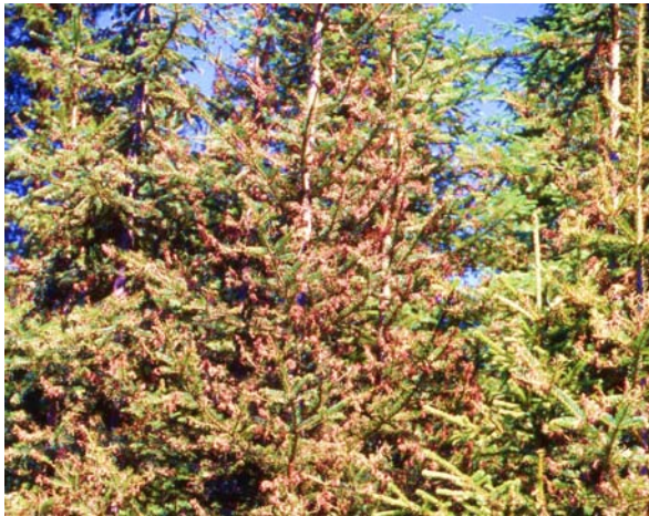
Figure 1. New growth on grand fir killed by late spring frost.

The most common form of frost injury occurs when temperatures drop below freezing on clear nights after buds break and new growth begins in the spring. When late spring frosts occur, the new growth is killed and turns bright red. It often remains on the tree all year (Figure 1). Older foliage is undamaged. Both terminal and branch