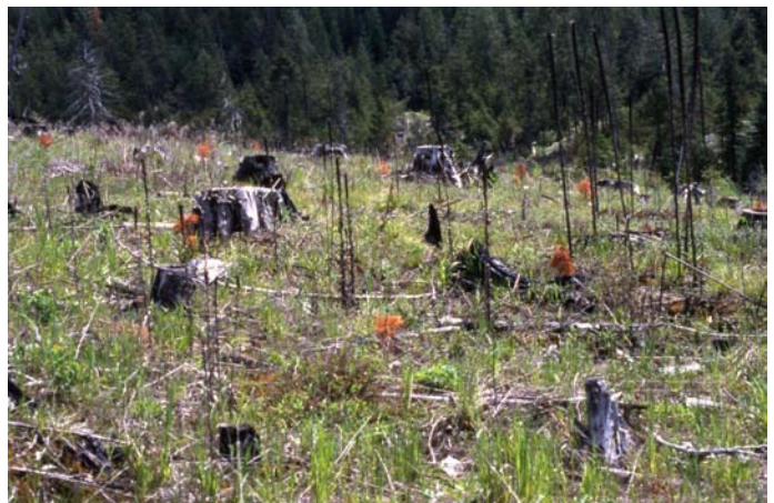
Figure 4. Winter desiccation on white pine seedlings.

Winter desiccation is another form of freezing injury in conifers. It occurs when the above-ground or above-snowline parts of trees are exposed to