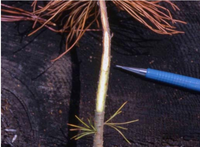
Figure 5. Winter desiccation. Only the portion of the seedling above the snow line was affected. The stem below the pencil was still alive.

warm, dry air and sun while the unexposed parts remain at temperatures near or below freezing (figures 4, 5). In these situations, excessive water loss from the needles results in the death of some or all of the exposed foliage (Sutinen and others 2001).