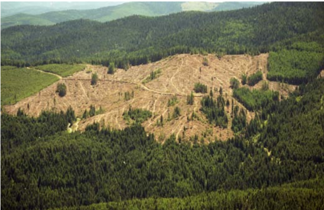
Figure 8. Cold air dam created by solid wall of timber across the lower edge of the harvest unit.

cold air within harvest units (figure 8).