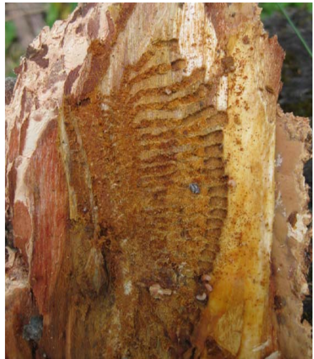
Each egg is laid in an individual niche.

Since Douglas-fir beetle outbreaks are normally initiated by catastrophic events that cause a lot of downed trees, timely salvage of down or severely weakened Douglas-fir is a primary tool in preventing Douglas-fir beetle outbreaks. Salvage needs to be accomplished either before the beetles attack, or before they can emerge the following spring. If trees are