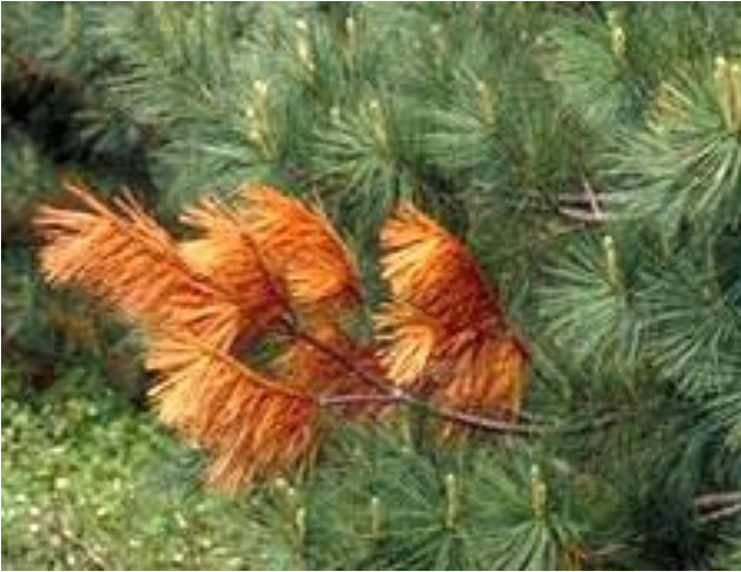
Figure 4. A typical “branch flag” caused by a blister rust canker girdling a branch (Photo by John Schwandt, USFS).

develops. Cankers are often spindle-shaped, and are frequently covered with excessive amounts of resin. Cankers often have yellow or orange-colored margins that are especially visible when the bark is wet. During the spring and early summer, yellow to orange blisters develop on or near the margins; these contain the spores that will infect Ribes leaves.