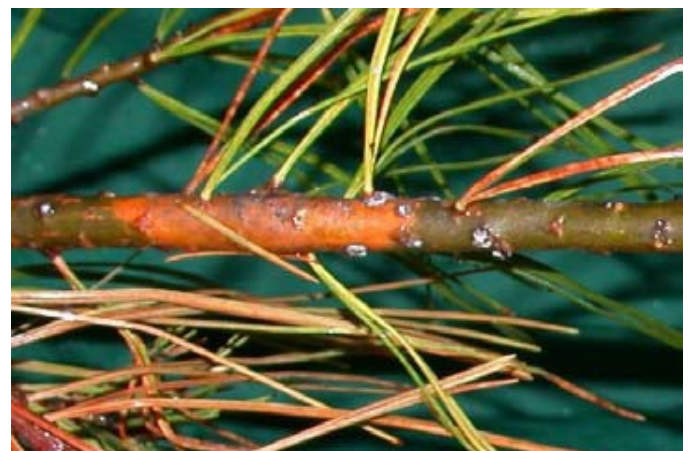
Figure 3. Early stage of branch infection. Note cluster of dead needles in discolored area; this likely holds the needle where the infection began.

are most likely to be covered by dew for the longest periods of time. Once infection occurs, the fungus grows down the needle to the base of the needle cluster and into the branch (Figure 3).