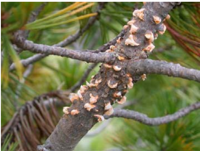
Figure 2. Distinctive blister-like structures that form on cankers of infected white pine which produce spores that infect Ribes in early spring.

are most likely to be covered by dew for the longest periods of time. Once infection occurs, the fungus grows down the needle to the base of the needle cluster and into the branch (Figure 3).