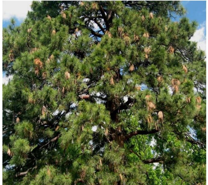
Figure 4. Shoot dieback distal to western gall rust infections in mature, heavily-infected ponderosa pine.

Galls located near the ends of branches often die from secondary fungi and/or insect infestation. This kills the portion of the branch beyond where c @ ^ Á * æ | | Á , æ • Á | [ & æ c ^ á Ê Á & æ ~ • ä } * A æ A % ~ | æ * É + A [ ! Á á ^ æ á Á