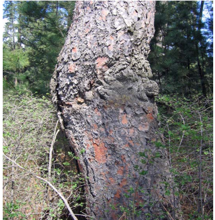
Figure 6. Large hip canker in stem of mature ponderosa pine.

Mortality, growth loss, and defect are the main types of damage caused by severe infections of western gall rust, but their impact varies greatly by locality and tree age. Mortality is most common when seedlings and saplings are infected, but sometimes poles and small saw-timber-size trees are killed. Some trees, particularly ponderosa pine, can develop hundreds of branch cankers and suffer growth reductions. Defect caused by western gall rust is due to trunk cankers (Figures 5 & 6). Tree stems are frequently weakened where cankers occur and can break off in the wind. Trees with bole cankers in recreation sites or near homes can pose a hazard.