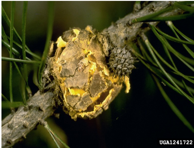
Figure 3. Sporulating gall.

windborne spores that infect the green, succulent tissue of expanding pine shoots.