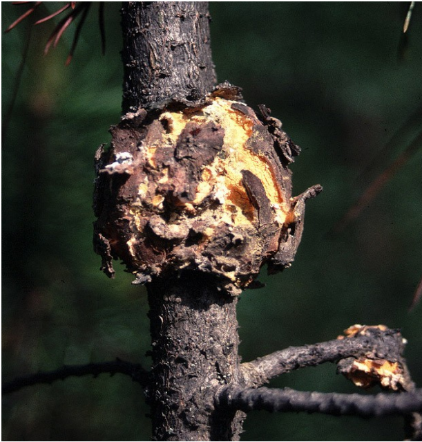
Figure 1. Typical, medium-size gall of western gall rust.

Western gall rust, caused by the fungus Endocronartium harknessii , is a very common branch and stem disease of ponderosa and lodgepole pines (Figures 1 & 2). It is a native disease in the western United States and occurs throughout Idaho. Damage is generally more severe in the southern portion of the state. Western white, whitebark, and limber pines are not susceptible to this fungi.