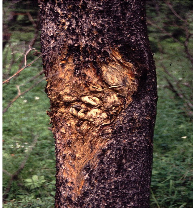
Figure 2. Western gall rust on a lodgepole pine.