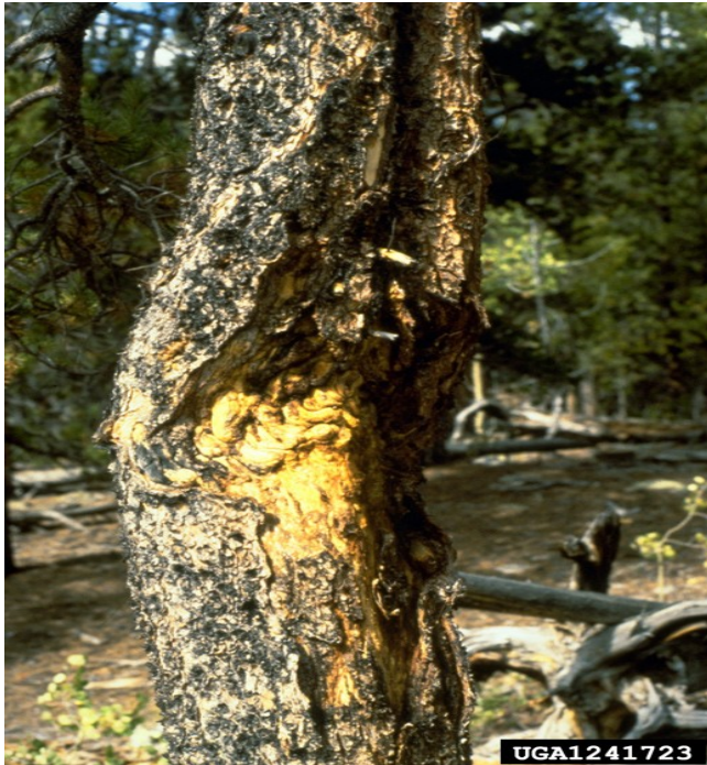
Figure 5. Large gall on stem of ponderosa pine.