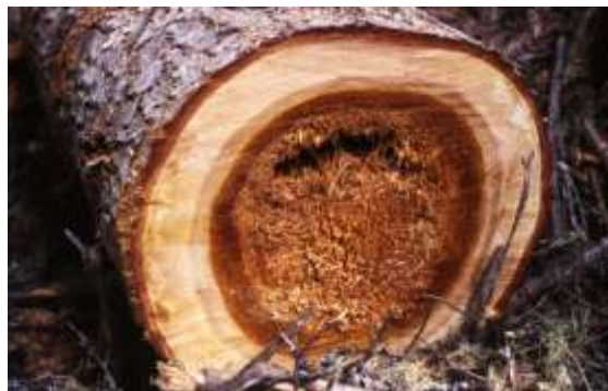
Figure 2. Heart rot in grand fir caused by the Indian paint fungus ( Echinodontium tinctorium ).

Stem decay organisms can be roughly classified as to whether they primarily attack the heartwood of living trees or the heartwood or sapwood of dead trees and branches. Sapwood is the layer of wood inside the bark and cambium that contains living xylem cells and is physiologically active. The width of the sapwood varies with species and tree vigor. Heartwood is non-living and develops in the center of the tree as the tree grows. Depending on species, the heartwood is often a darker color than the surrounding ring of sapwood.