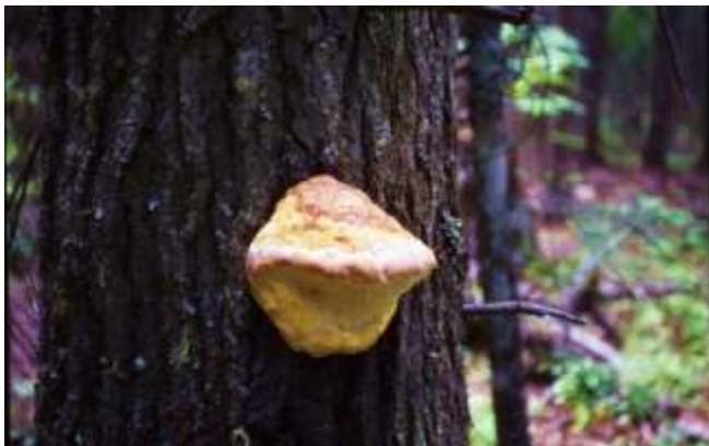
Figure 4. Shelfing conk of the red belt fungus (Fomitopsis pinicola).

Conks may be hoof-shaped or shelf-like (Figure 4) or grow flat like a crust on the surface of wood or bark (Figure 5).