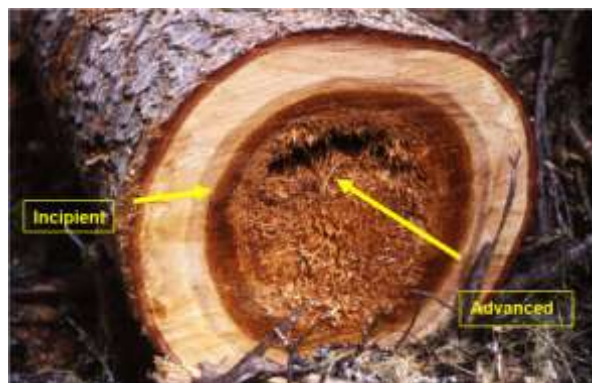
Figure 9. Incipient and advanced decay in grand fir.

base of the tree that is infused with water and appears water soaked or discolored (Filip et al. 1984). It is not incipient decay, although it often affects the grade of lumber manufactured from it.