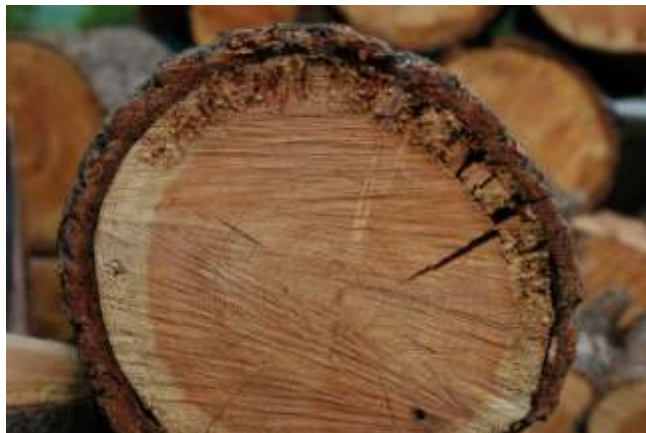
Figure 3. Sap rot in a Douglas-fir log from a tree attacked by bark beetles.

Heartrot fungi attack the heartwood cells of living trees (Figure 2). These fungi do not invade sound trees but gain entrance to living trees when wind-disseminated spores come in contact with heartwood exposed by wounds, broken tops, logging and fire scars, or dead branch stubs.