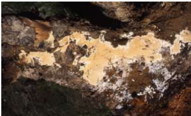
Figure 5. Crust-like conk of the laminated root disease fungus (Phellinus weirii).

These are often formed on the bole under or on dead branches. Spores are produced on the underside of the conk in small pores or on teeth or gills depending on the fungus species.