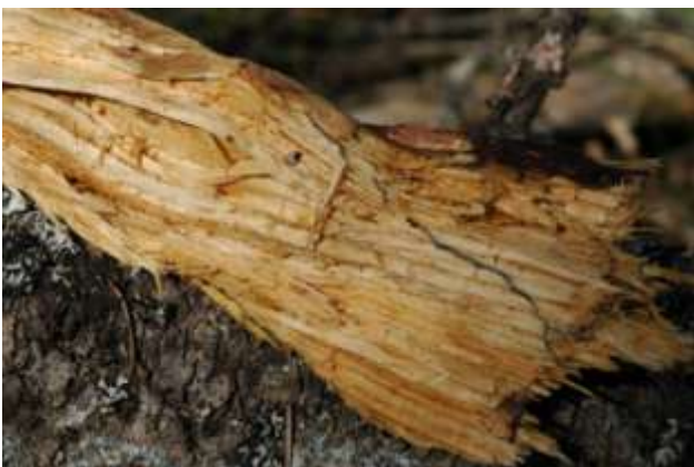
Figure 8. White stringy rot caused by Armillaria ostoyae.

Some white rot decays produce small pockets where most of the wood has been removed, leaving a residue of light-colored cellulose. Pockets produced by some decays have this white lining while other decays produce empty pockets.