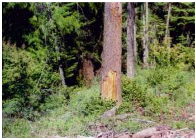
Figure 11. Tree injured during harvest operations.