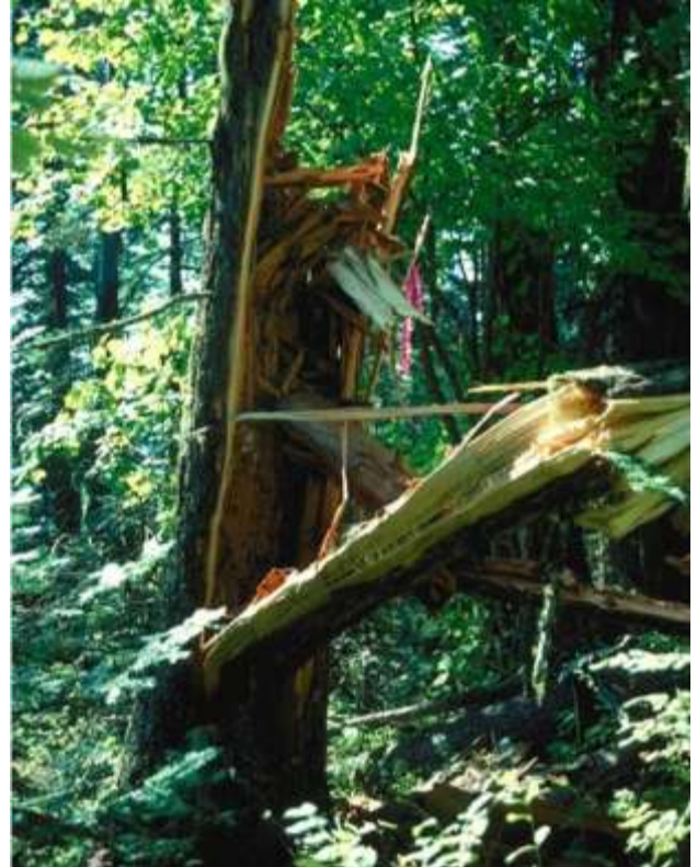
Figure 1. Stem breakage resulting from advanced decay.