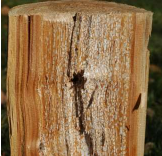
Figure 7. White pocket rot.

easily separated, often into long strings as with decay produced by the Indian paint fungus ( Echinodontium tinctorium ) or Armillaria ostoye (Figure 8).