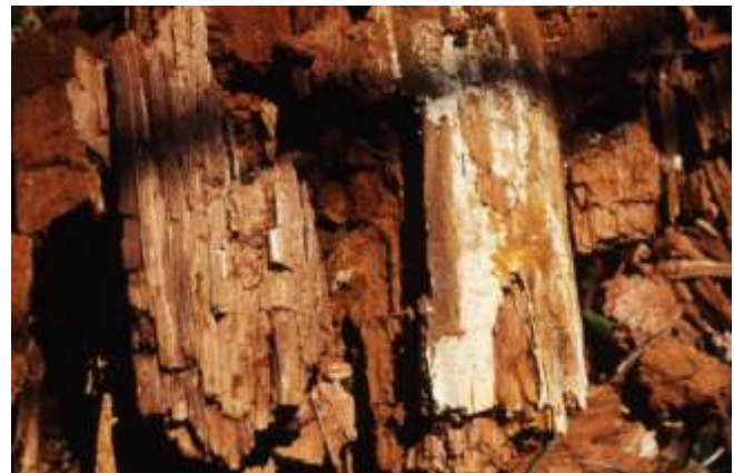
Figure 6. Brown cubical decay.

Brown rot fungi primarily decompose cellulose and hemicellulose, leaving much of the brown-colored lignin (Figure 6). The loss of the cellulose fibers allows the decayed wood to fracture cross-grain, resulting in a cubical, crumbly appearance. These fungi do not degrade enough of the lignin to cause the cellulose fibers to separate into a fibrous decay.