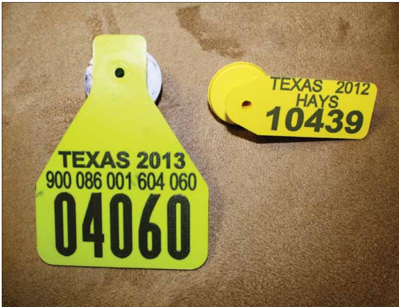
Figure 4. Swine ear tags similar to those that may be present on feral hogs.

For a complete list of feral hog approved holding facilities in Texas visit: http://tahc.state.tx.us/animal_health/feral_swine.html .