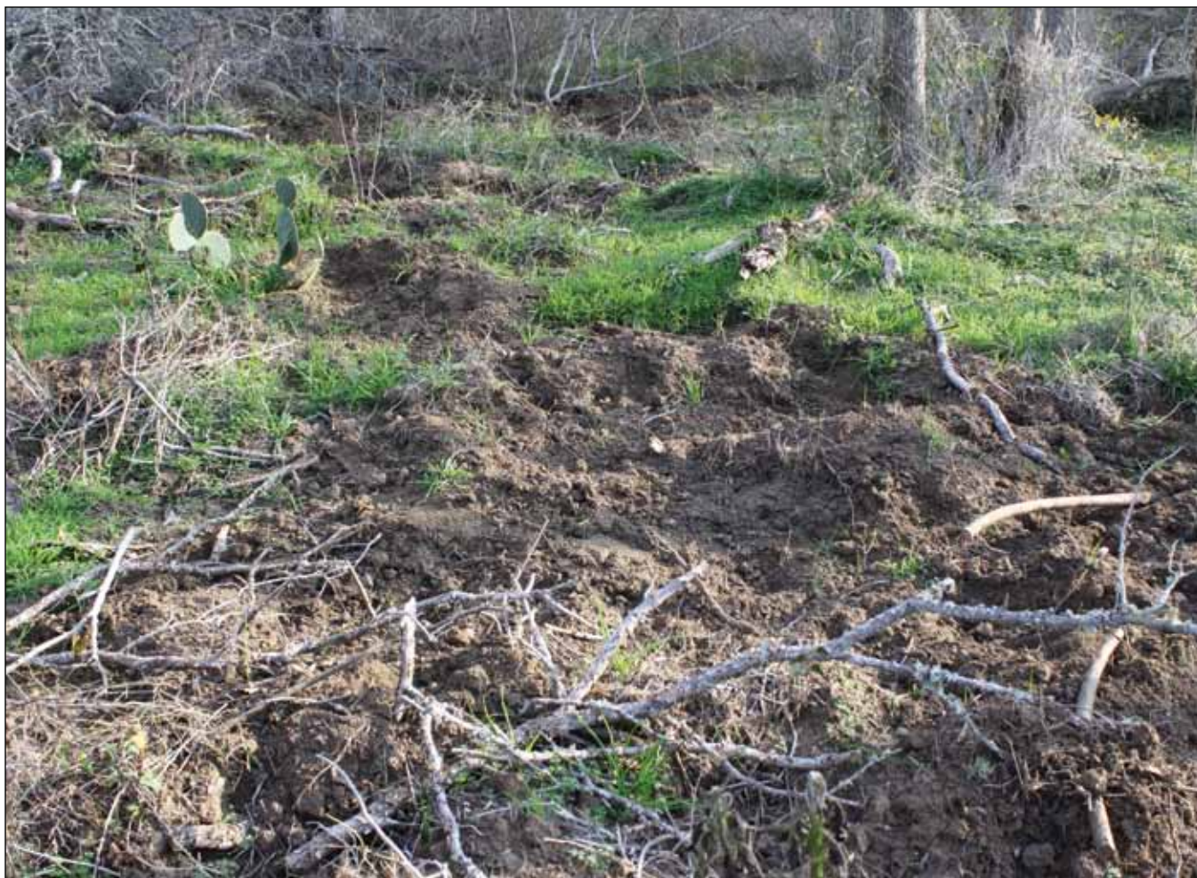
Figure 1. Feral hogs are known for their destructive rooting behavior, as they forage for food. This act can be devastating to pastures, row crops, and wildlife habitat.