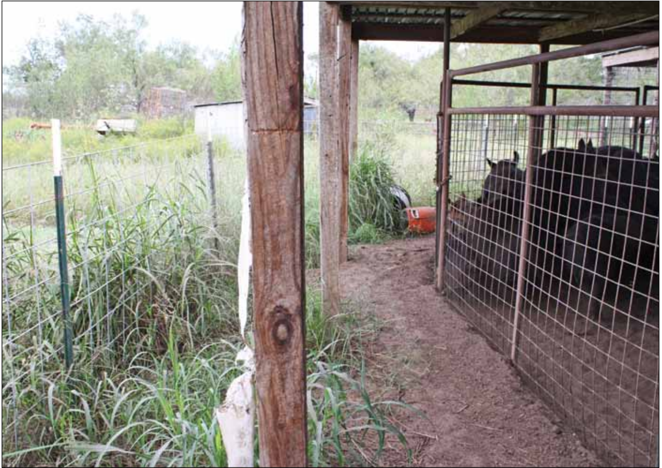
Figure 3. Feral hog approved holding facilities are double fenced to prevent escape.

be promptly removed from the facility and disposed of in accordance with any applicable requirements, or ordinances, or at the direction of the TAHC.