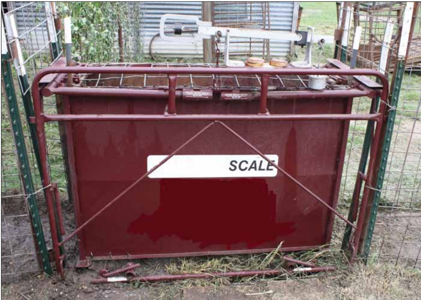
Figure 2. Feral hogs are weighed and sold to approved holding facilities on a price per pound basis.

Approved holding facilities are regulated by the TAHC, however they are not involved in the purchase transaction or price set by the operator. Prices vary by region and over time. Currently, live sale prices are around $0.10-$0.20 per pound for feral hogs weighing up to 100 lbs, $0.30 cents per pound for animals between 100 and 150 lbs, and $0.60 cents per pound for feral hogs 150 lbs and heavier (Figure 2). This income may help to offset damage costs caused by feral hogs. Approved holding facilities temporarily hold feral hogs until a full truck load can be assembled and transported to a processing facility or authorized hunting preserve. At this time there are two feral hog processing facilities in Texas and most processed meat is sold and shipped to overseas markets.