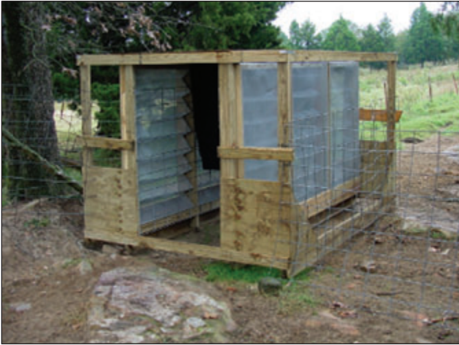
Figure 6. A walk-through (Bruce) horn fly trap.

The life cycle of the horn fly consists of the same life stages as the house fly. It takes horn flies 9 to 12 days to complete the cycle from egg to adult. The adults live from 6 to 8 weeks, and mating occurs on the host about 3 days after emergence. There are two seasonal horn fly peaks during spring and fall, and they overwinter in the soil as pupae. Large populations can result in a decrease in body weight and feed efficiency related to blood loss and annoyance to the animal. Large horn fly numbers can also cause a 10 to 20 percent decrease in milk production.