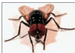
Figure 2. Black garbage fly.