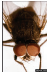
Figure 7. The face fly.

The face fly (Figure 7), Musca autumnalis , is a non-biting fly that resembles a house fly. Unlike horn flies and stable flies, they do not bite but are still parasitic on the animals because they feed on animal secretions (such as secretions found around the eyes and nose). Activity around the cows’ eyes (Figure 8) allows face flies to be potential vectors of eye diseases, such as pinkeye. The flies also result in economic losses from decreased weight gain and milk production.