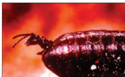
Figure 4. A parasitic wasp emerging from a house fly pupa.

Parasitoids prevent emergence of adult flies from parasitized pupae. The life cycle of a parasitoid consists of the tiny wasp stinging the fly pupa in order to lay eggs inside. The eggs hatch into larvae which feed on the developing fly pupa within the pupal case, and then the adult wasp emerges from the fly pupa (Figure 4), leaving no adult fly to emerge. Successful fly management with parasitoids must include an effective manure management program so the wasps do not become overwhelmed with a large number of house flies.