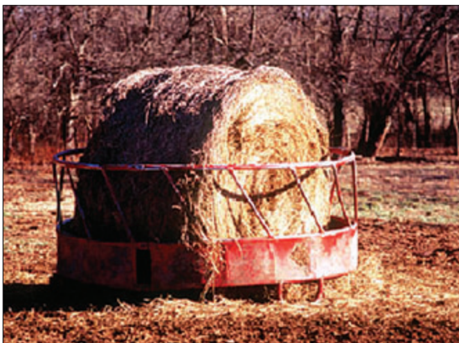
Figure 10. Potential stable fly breeding site. (University of Missouri Extension Service)

parts similar to horn flies; their piercing mouth-parts protrude from under their heads and allow them to take blood meals. Both male and female stable flies feed on blood.