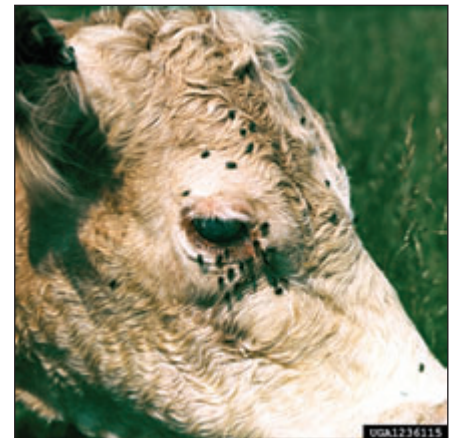
Figure 8. Face flies feeding on cattle.

Female face flies are primarily found clustering around the eyes and nose of cattle, whereas the males feed only on nectar and dung. They breed in fresh cattle feces with a life cycle similar to horn flies. The cycle from egg to adult is completed within 11 to 17 days, and they overwinter as adults in protected areas, such as farmhouses, barns, church steeples, etc.