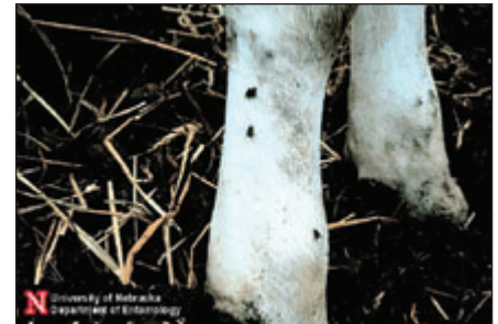
Figure 11. Stable flies feeding on the legs of cattle.

Augmenting with commercial parasitoids in organic dairy production can keep stable fly populations at a level where little or no chemical control is needed, just as with house flies. The same procedures listed for parasitoid use in house fly control should be applied for stable flies. Successful fly management with parasitoids must also include an effective manure management program. If insecticides are needed to control stable flies, pyrethrins can be used. Synergists, such as piperonyl butoxide, are not listed for organic production, so use insecticides labeled “pyrethrin only.” Make sure to follow label instructions. Avoid using direct treatments of pesticides in fly-breeding areas where wasps have been released to ensure the beneficial insects survive.