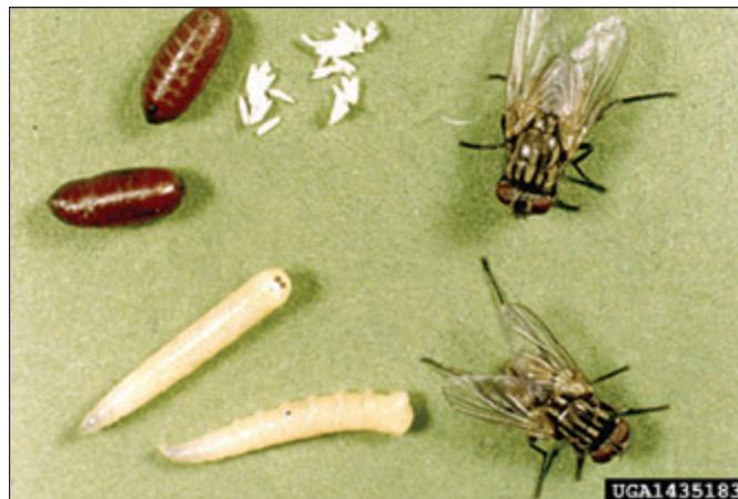
Figure 1. The life cycle of the house fly. (Clemson University, USDA Cooperative Extension Slide Series, Bugwood.org)

Large numbers of house flies can become a serious nuisance around the dairy and to nearby neighbors and potentially pose public health threats