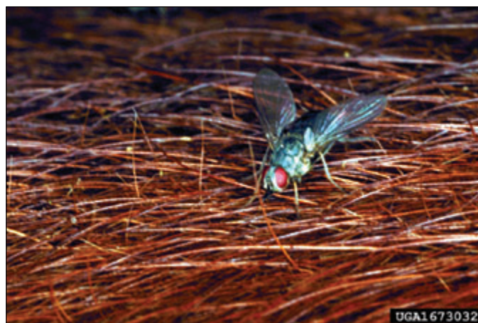
Figure 5. A horn fly feeding on a cow.

They are similar in color to a stable fly but half the size. Horn flies have spear-like piercing mouthparts protruding from under their heads which allow them to feed on blood. Horn flies spend all their time on the animal except when a female leaves to deposit eggs in fresh cattle feces less than 10 minutes old. Females usually lay no more than 20 eggs per batch, which are deposited in groups of three to seven. During her lifetime, a female can lay 200 to 500 eggs.