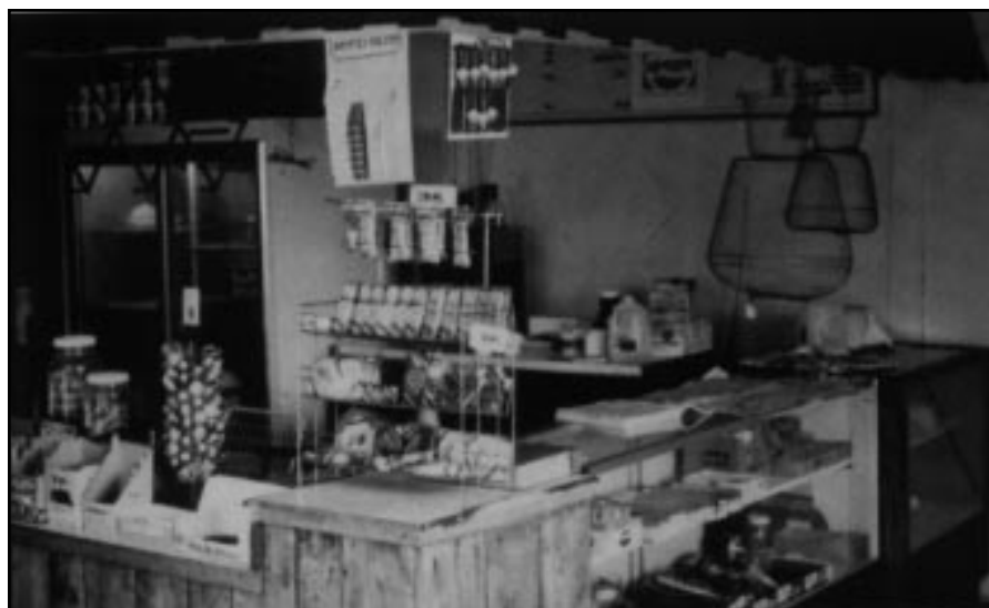
Concessions can increase profit potential.

Intensively managed fee-fishing operations should have multiple ponds. This enables the manager to better control fishing success and to isolate and treat diseases or other problems. If several ponds are available, the manager can move patrons to ponds where fish are actively biting, assuring successful and satisfied customers. Fish can be moved from one pond to another to increase densities and catchability. Also, fish of unknown condition (i.e., purchased off-farm) can be isolated in a separate pond away from other fish so there is no chance of disease transmission. If a single pond