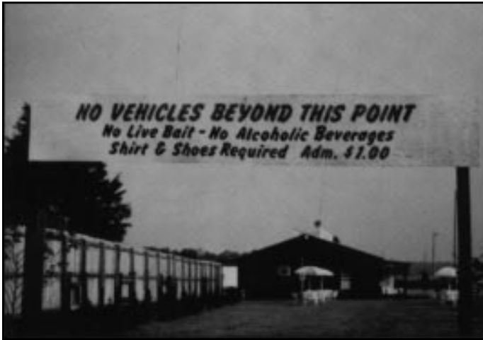
Regulations should be in obvious places.