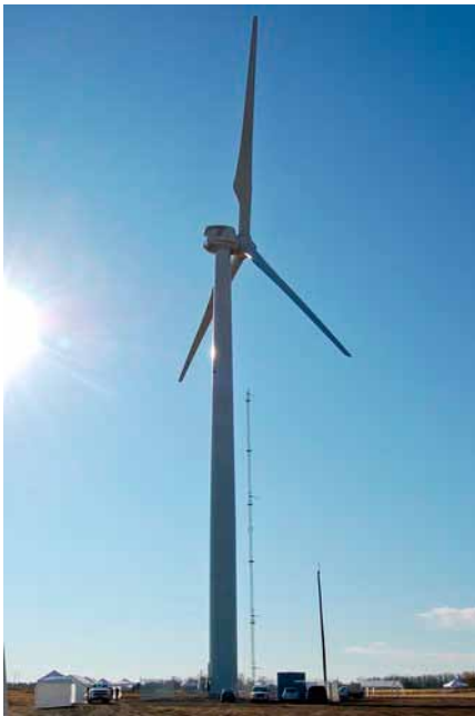
Utility-Scale Wind turbine with an anemometer tower in the background.

energy project is likely to result in take of listed threatened or endangered wildlife species. For more information regarding formal consultation and the requirements of obtaining HCPs, please see the Endangered Species Consultation Handbook at http://www.fws.gov/endangered/esa-library/index.html#consultations and the Service's HCP website, http://www.fws.gov/endangered/what-we-do/hcp-overview.html .