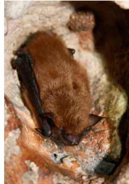
Big brown bat.

Comparing fatality rates among facilities with similar characteristics can be useful to determine patterns and broader landscape relationships. Developers should communicate with the Service to ensure that such comparisons are appropriate to avoid false conclusions. Fatality rates should be expressed on a per nameplate MW or some other standardized metric basis for comparison with other projects,