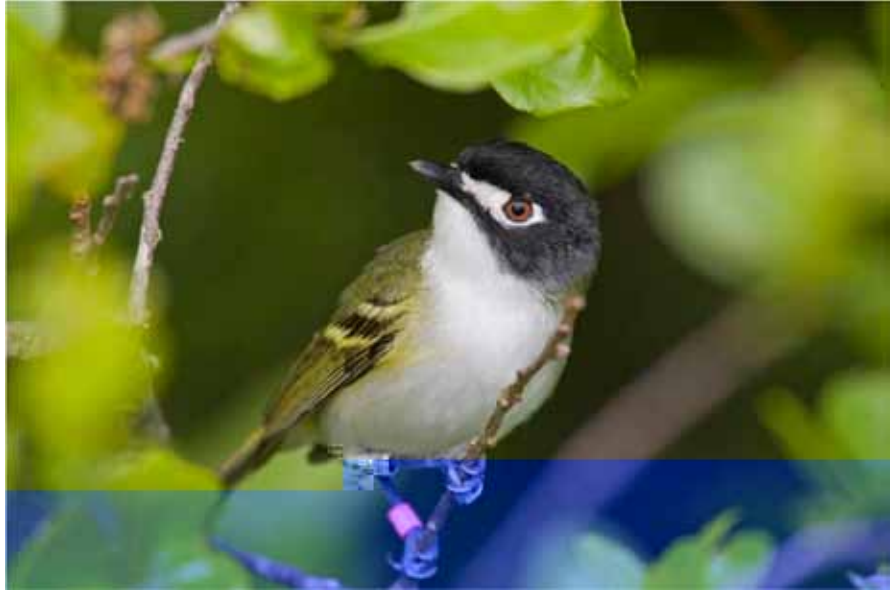
Black-capped Vireo.

Significant direct or indirect loss of habitat for a species of concern may occur without habitat fragmentation if project impacts result in the reduction of a habitat resource that potentially is limiting to the affected population. Impacts of this type include loss of use of breeding habitat or loss of a significant portion of the habitat of a federally or state protected species. This would be evaluated by determining the amount of the resource that is lost and determining if this loss would potentially result in significant impacts to the affected population. Evaluation of potential significant