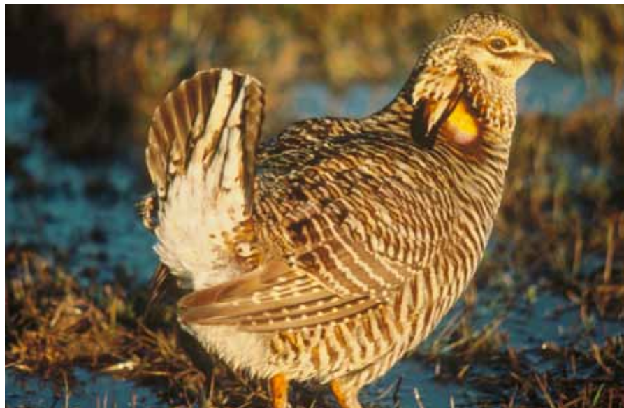
Attwater's prairie chicken.

Some areas may be inappropriate for large scale development because they have been recognized according to scientifically credible information as having high wildlife value, based solely on their ecological rarity and intactness (e.g., Audubon Important Bird Areas, The Nature Conservancy portfolio sites, state wildlife action plan priority habitats). It is important to identify such areas through the tiered approach, as reflected in Tier 1, Question 2 below. Many of North America's native landscapes are greatly diminished, with some existing at less than 10 percent of their pre-settlement occurrence.