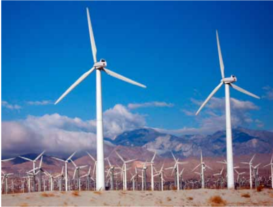
Rows of wind turbines.

Studies to assess impacts may include quantifying species' habitat loss (e.g., acres of lost grassland habitat for grassland songbirds) and habitat modification. For example, an increase in edge may result in greater nest parasitism and nest predation. Assessing indirect impacts may include two important components: 1) indirect effects on wildlife resulting from displacement, due to disturbance, habitat fragmentation, loss, and alteration; and 2) demographic effects that may occur at the local, regional or population-wide levels due to reduced nesting and breeding densities, increased isolation between habitat patches, and effects on behavior (e.g., stress, interruption, and modification). These factors can individually or cumulatively affect wildlife, although some species may be able to habituate to some or perhaps all habitat changes. Indirect impacts may be difficult to quantify but their effects may be significant (e.g., Stewart et al. 2007, Pearce-Higgins et al. 2008, Bright et al. 2008, Drewitt and Langston 2006, Robel et al. 2004, Pruett et al. 2009).