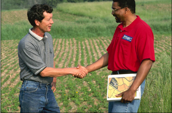
Helping People Help the Land

There is no charge for our assistance. Simply call your local office at the number listed below to set up an appointment and we will come to your farm.