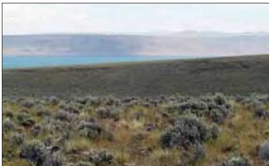
Healthy sagebrush steppe habitat.