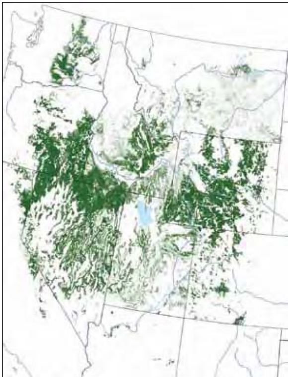
The sagebrush region of the Intermountain West.