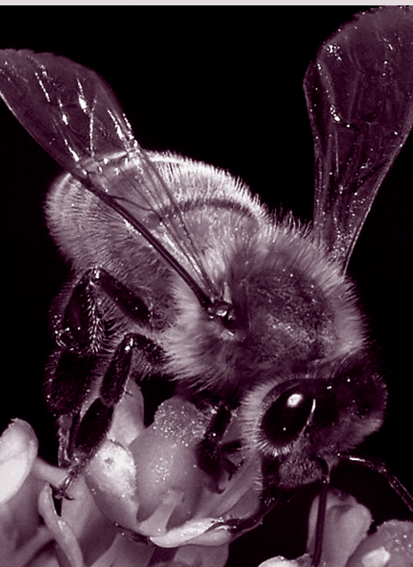
Tiger Swallowtail butterfly on Purple Hollyhock, (above), and a honey bee on a large holly bush in the Atlanta, Georgia area.