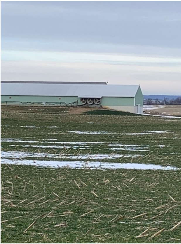
Fig. 2 Winter cover crop on corn field holds carbon in the soil and minimizes soil erosion in Lancaster County, Pennsylvania, USA

Roesch-McNally et al. 2017). A lack of cover crops leaves the land vulnerable to soil erosion from wind and rain and releases carbon (Clark 2015). Planting a continual single crop, such as corn, or a corn-soybean rotation reduces soil nutrients and creates a greater reliance on chemical fertilizers derived from natural gas (methane) (Philpott 2020; Roesch-McNally et al. 2017). Finally, CAFOs produce huge amounts of manure that add to methane and nitrous oxide emissions (Sharma et al. 2022, p. 9).