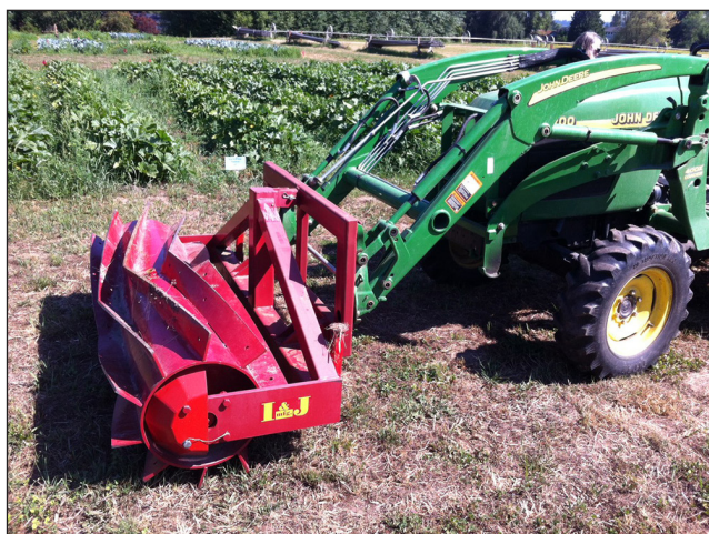
Figure 6 Roller crimper

Biorationals: Ecological Pest Management Database (ATTRA) https://attra.ncat.org/attra-pub/biorationals/ . This tool provides information on organic and other pesticides as well as preventive measures for common pests; allows searches by pest, trade name, or active ingredient; has links to labels and manufacturer information; and notes which materials are listed by OMRI (Organic Materials Review Institute). Because OMRI listings are frequently updated, organic producers should check with their certifiers prior to applying any materials to their crops or livestock.