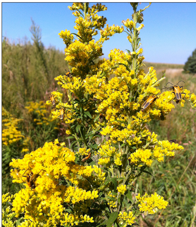
Figure 8 Plants in a buffer area attracting beneficial goldenrod soldier beetles

https://attra.ncat.org/attra-pub/summaries/summary.php?pub=115 . This publication is designed to help farmers, watershed managers, and environmentalists understand what healthy riparian areas look like, how they operate, and why they are important for the environment and society. It also discusses the costs and benefits of riparian management, and how watershed residents can work together to protect this vital resource.