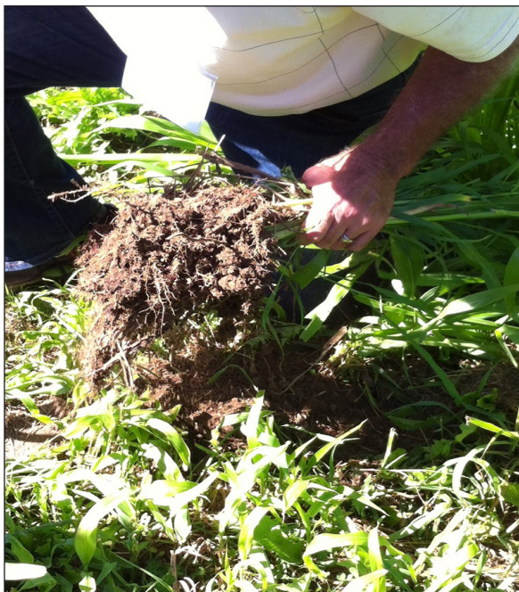
Figure 3 Roots and soil under organically managed sudan grass cover crop

State-specific versions of this guide are being developed for certain States; final versions will be available here: http://www.nrcs.usda.gov/wps/portal/nrcs/main/national/landuse/crops/organic/ . This publication discusses CPS 590 as a tool for meeting the USDA organic regulations' nutrient management requirements and minimizing environmental risks from applied N and P. It covers major and minor nutrients, and how to estimate N release from cover crops, past organic inputs, and soil organic matter.