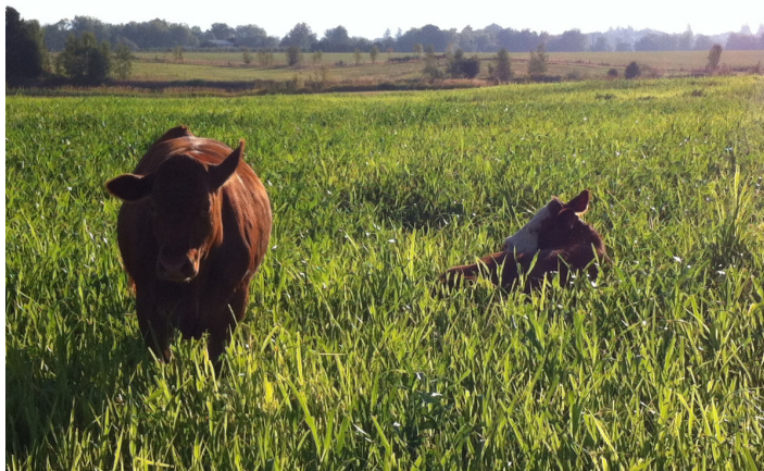
Figure 9 Cows in sudan grass on an organic farm

Treated Wood on Organic Farms (University of Tennessee): https://utextension.tennessee.edu/publications/Documents/W235-H.pdf . This publication discusses the USDA organic rule, alternative materials, and other topics.