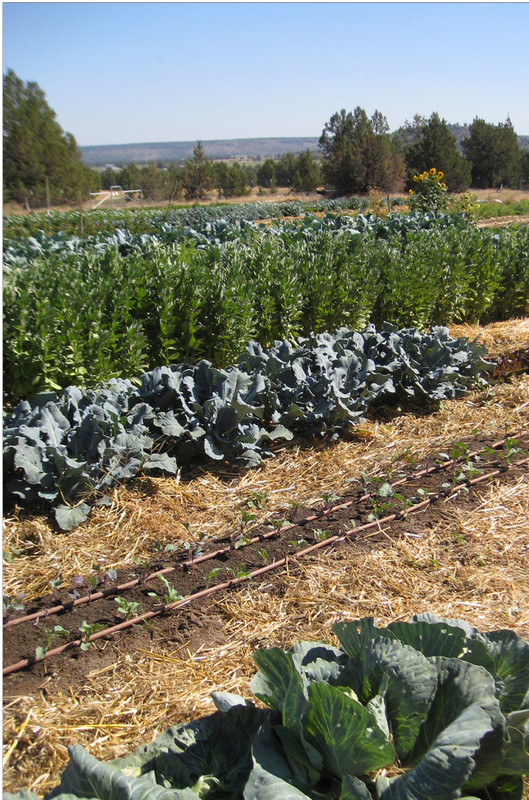
Figure 5 Diverse mixture of vegetable crops on an organic farm

http://www.extension.org/pages/18634/use-of-tillage-in-organic-farming-systems-the-basics . This article describes the benefits and drawbacks of different forms of tillage and considerations when making decisions about tillage and tillage implements. Conservation tillage and no-till are also discussed briefly.