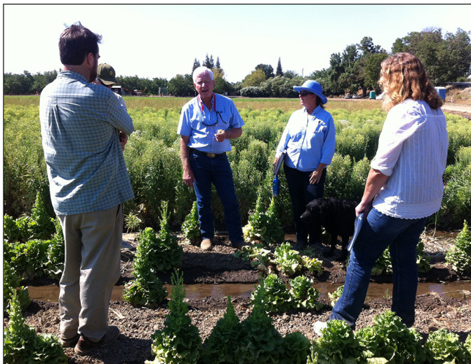
Figure 2 NRCS staff and producers discuss organically managed lettuce seed production

A producer sends their completed OSP along with a base payment to the certification agency. If all farm management information, field maps, and input ingredient information is complete, the certification agency reviews the OSP and then assigns the file to an inspector. If it appears the operation does not meet organic regulations, the certification agency will typically discuss areas of noncompliance with the operator and outline steps that need to be taken before the organic certification process can move forward. Once certified, organic producers must update their OSP throughout the year.