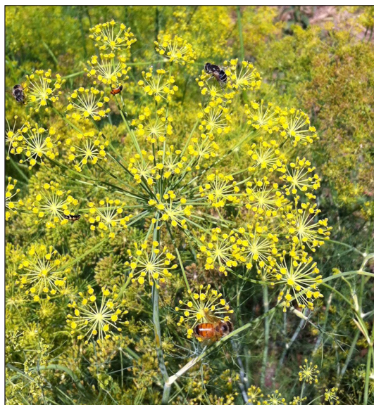
Figure 7 Flowers from dill

Farmscaping to Enhance Biological Control (ATTRA) https://attra.ncat.org/organic.html#pests . This bulletin gives in-depth guidance on developing a beneficial insect habitat based on farmer objectives, crops grown, prevalent pests and natural enemies, and characteristics of various annual and perennial insectary plants. It also covers habitat for predatory birds and bats, and includes an annotated bibliography of information resources.