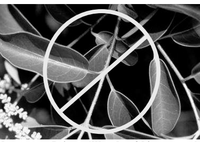
Japanese Privet (Wax Leaf Ligustrum)