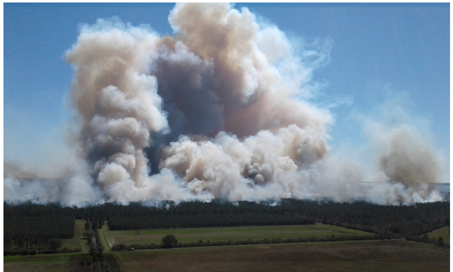
Aerial view of the prescribed burn.

Without help from the GCPEP or similar partnerships, landscape-level prescribed burns like the one at Yellow River would not have occurred.