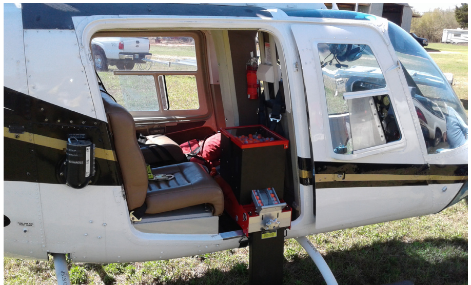
Helicopter used to ignite the prescribed burn using a Red Dragon Aerial Ignition Device at the Yellow River Water Management area in Santa Rosa County, Florida.

The GCPEP land management partnership formed in 1996, beginning with six partners in 1996 and growing to fifteen partners today. Partners include private landowners and public agency land managers, who together manage a total of 1.3 million acres. Partners include the Department of Defense (Eglin Air Force Base, Naval Air Station – Pensacola, Naval Air Station Whiting Field), Florida Forest Service, Northwest Florida Water Management District, United States Forest Service, Florida Department of Environmental Protection, Nokuse Plantation, National Park Service, Gulf Power, The Nature Conservancy, Florida Fish and Wildlife Conservation Commission, Westervelt Ecological Services, Resource Management Service, Escambia County, FL, National Wild Turkey Federation, and The Longleaf Alliance. The GCPEP partners have become very experienced with aerial burns over the last 20 years. As a result, many agencies send new employees to GCPEP burns to get burn experience. Seven of the GCPEP partners participated in the burn.