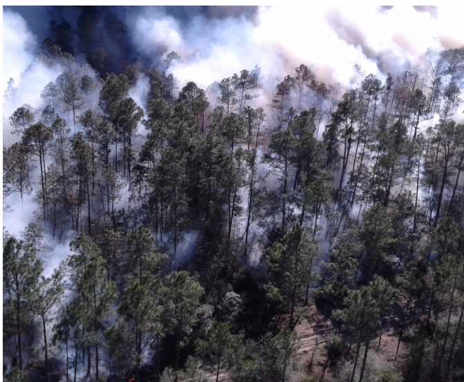
Aerial view of the prescribed burn.