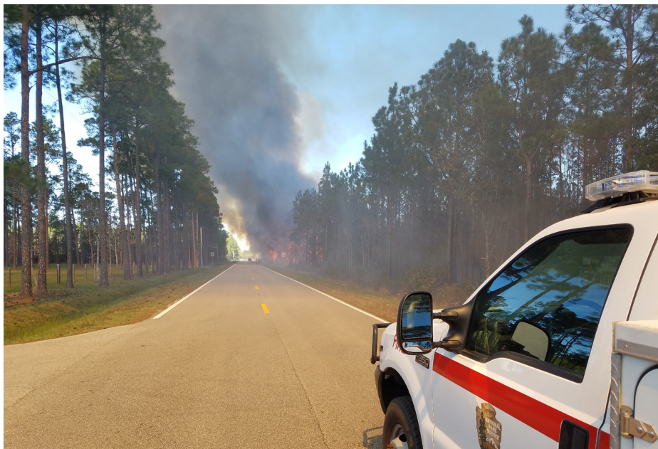
Monitoring smoke dispersion from the road.