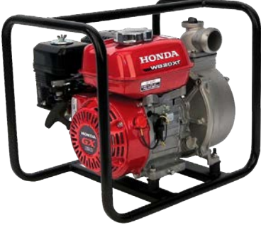
WB20XT4A HONDA 2" General Purpose Pump 164 gal./min. capacity, Weighs 44 lbs.