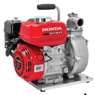
WH15XT2A HONDA 1-1/2" High Pressure Pump 57 psi max., 98 gal./min. capacity Weighs 49 lbs.