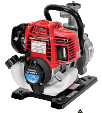
WX10TA HONDA 1" General Purpose Pump 32 gal./min. capacity, Weighs 13 lbs.