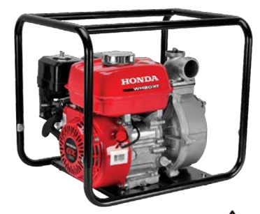
WH20XTAF HONDA 1.2" High Pressure Pump 64 psi max., 119 gal./min. capacity Weighs 60 lbs.