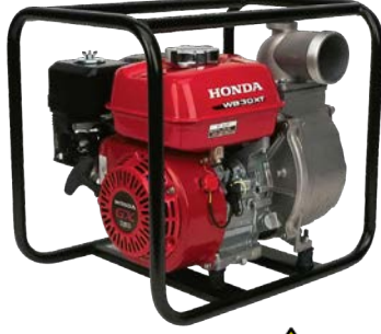
WB30XT3A HONDA 13" General Purpose Pump 290 gal./min. capacity, Weighs 57 lbs.