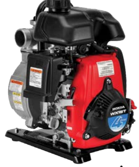
WX15TA HONDA 1-1/2" General Purpose Pump 74 gal./min. capacity, Weighs 20 lbs.