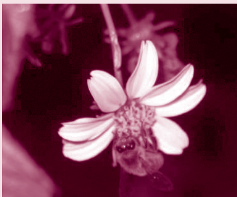
Wild honey bee on bidens sp.

“CONSERVE HAWAII’S UNIQUE NATIVE PLANTS BY INCLUDING THEM IN HOME LANDSCAPING. NATIVE PLANTS ADD BEAUTY, VARIETY AND FOOD SOURCES FOR NATIVE POLLINATORS AND HONEY BEES.”