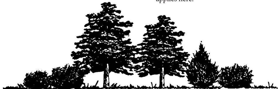
Figure 2: Ladder fuels enable fire to travel from the ground surface into shrubs and then into the tree canopy.