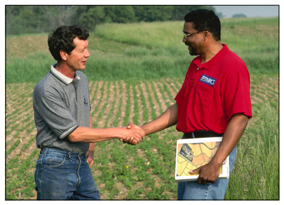
Helping People Help the Land

You may also be eligible to receive financial assistance, through a state or federal program. Your NRCS office will explain any programs that are available so you can make the best decision for your operation. All NRCS programs and services are voluntary.