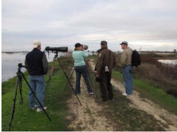
Refuge birding tour using trails

As you explore this area on foot, use binoculars and spotting scopes to bring wildlife closer into view without disturbing them.