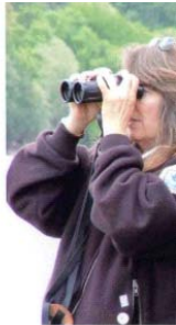
Take a Closer Look

Enjoy the variety of songbirds in the riparian forest on the trail marked in red. Birds, such as the Western Kingbird and Spotted Towhee, depend on the forest habitat for migration corridors and nesting areas.