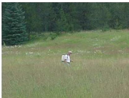
Out spraying Matgrass in a meadow near Bovill Idaho.

Herbicides continue to be a large part of the Palouse CWMA's war on weeds, as they are a cost effective way to many weeds over large areas. High use areas like campgrounds and camping areas, hiking trails and trailheads, and ATV and OHV recreation areas are a main focus as well as transportation corridors, roadsides, rockpits, and sites of weeds that are new invaders. Our contract sprayers also inventoried, GPSed and mapped the areas that they sprayed this year. Over 2,675 acres were treated in 2009.