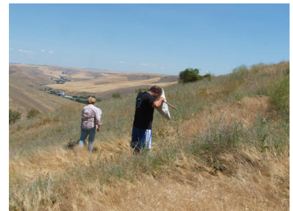
"I think there's some bugs in here" Looking for Eustenopus villosus during a collection day.