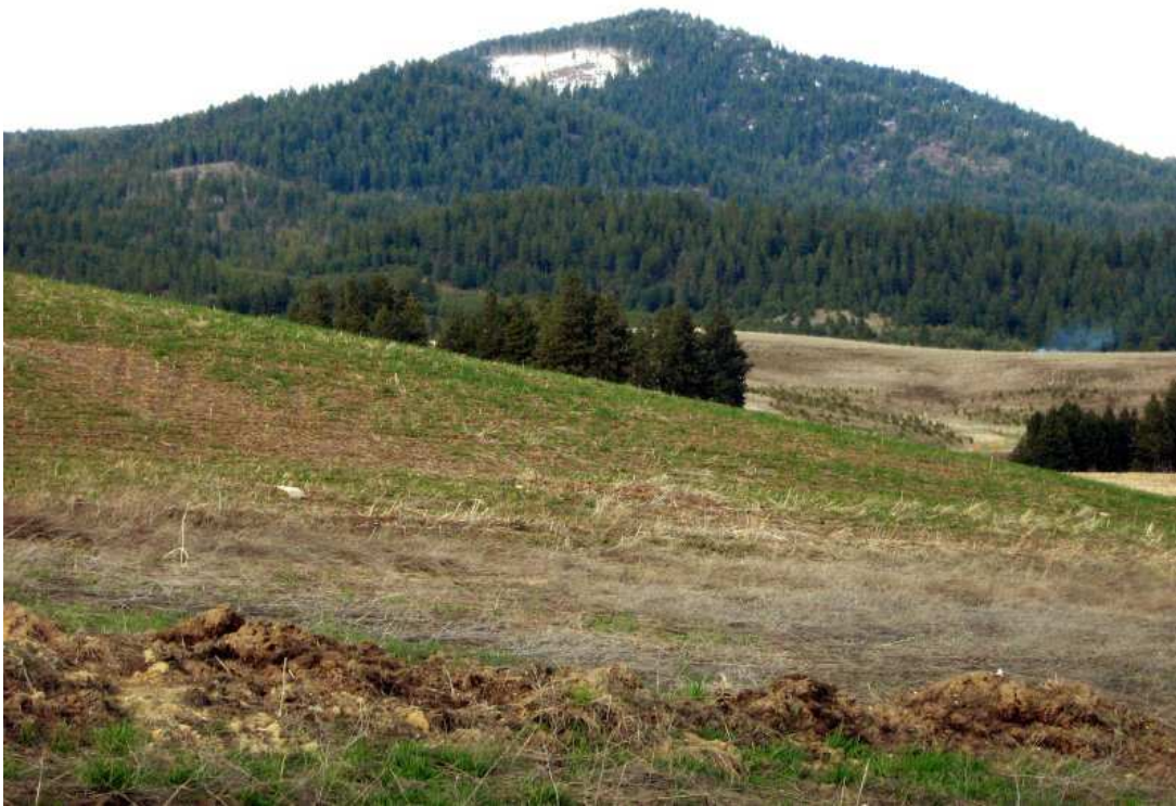
Moscow Mountain, behind some of the Palouse's famous rolling hills