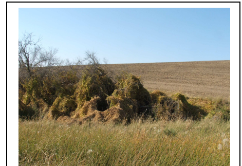
White Bryony plants smothering and killing native Black Hawthorne trees near Moscow.

White Bryony is a viney weed that acts similar to Kudzu, climbing over and smothering the plants it grows on. It is infesting and taking over areas of native Black Hawthorne trees on the Palouse. Tiege Ulschmid, from IDFG, coordinated the project focusing on the area known as Palouse Prairie which is South and East of Moscow. Private landowners were contacted for permission to scout and control any white bryony that potentially occurred on the property. The opportunity also provided a means to educate the landowner of the specie's presence. Direct injection method was used in an attempt to eradicate the plant. Upon finding the vine the base was exposed, the top scalped with a shovel, and approximately 1.25ml of Round-up Pro was injected into each tuber using a syringe. All sites were inventoried with a GPS to provide the opportunity to evaluate success rates with the direct injection method in 2010. A total of 392.25 acres were inventoried, 546 total plants were treated, and 66 private landowners contacted.