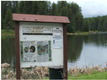
Noxious Weed information on the info board at Moose Creek Reservoir