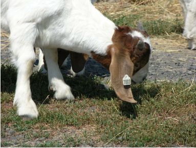
Goats munching on weeds for the Linden / Park neighborhood group.

Nine private landowners with over 9,000 acres make up the Linden Road / Park Road neighborhood group. Members are reimbursed for herbicide purchases for controlling noxious weeds on their property, which consists mostly of pasture and rangeland, hay ground and CRP. Members use mechanical and bio controls as well in their integrated weed management to control the weeds. Several members also participated in our Weed ID classes and bio control workshop.