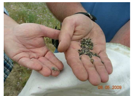
Cyphocleonus achates and Larinus minutus found at the trend monitoring site at Bishop Creek.