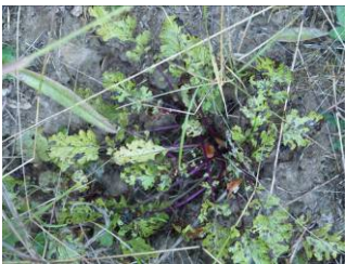
Tansy Ragwort rosette with damage from the Senecio Jacobae , the Tansy Ragwort Flea Beetle.