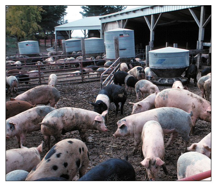
If it looks dirty and smelly, it probably is.