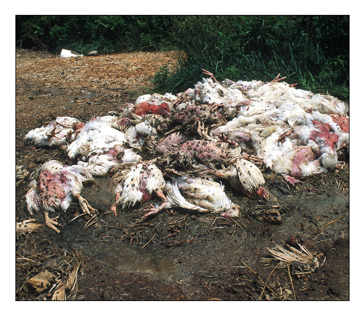
Dead animals can be a significant source of odors

Dead animals stink. Normal mortality from livestock operations must be properly handled for both odor control and to prevent the spread of diseases.