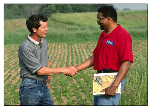
Helping People Help the Land

You may also be eligible to receive financial assistance, through a state or federal program. Your NRCS office will explain any programs that are available so you can make the best decision for your operation. All NRCS programs and services are voluntary.