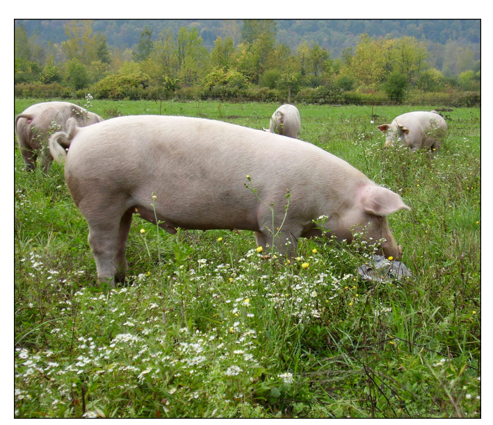
Clean dry animals do not smell as bad.