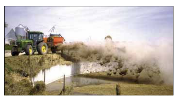
Chopped cornstalks or straw make a cover over a manure pond to reduce odors

Manure storage ponds and tanks can be a source of strong odors. Covers over a manure storage can reduce odors.