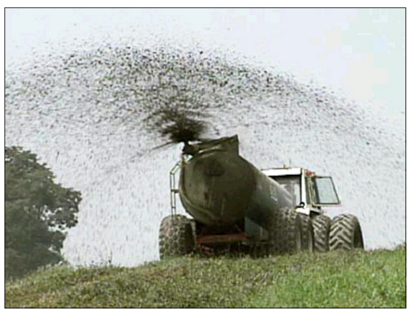
Throwing manure into the air when spreading can increase odors and complaints from neighbors

Apply manure only to crops at the recommended rates. Avoid application during windy periods. Pressure on sprinklers used to apply wastewater must be high enough for uniform distribution patterns, but not so high that the wastewater drifts. Turning the waste into the soil will reduce odors.