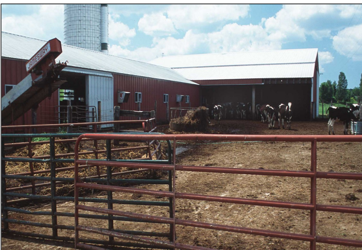
Manure is a valuable source of plant nutrients.