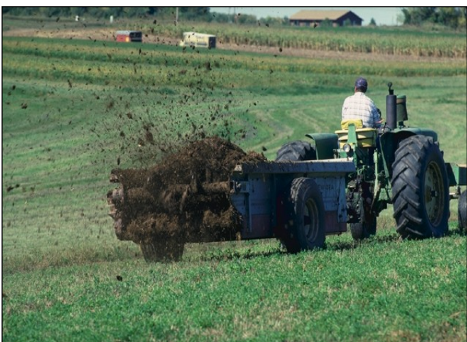
Spreading manure is like spreading chemical fertilizer. It contains (N) nitrogen, (P 2 O 5 ) phosphate, and potash (K 2 O) just like purchased fertilizer. It just looks and smells different.