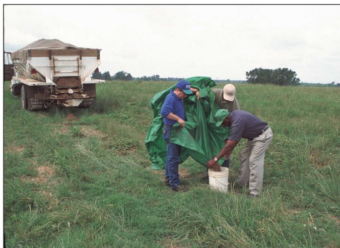
Manure application is calibrated by measuring the weight of manure applied over a measured area. In this case a 10 X 10 tarp is used to catch manure which is then weighed to determine tons/acre.