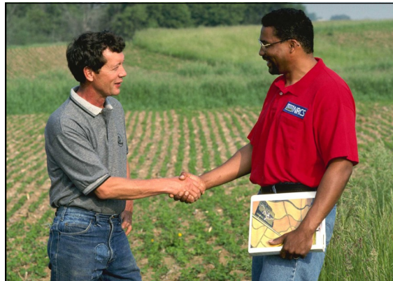
Helping People Help the Land

You may also be eligible to receive financial assistance, through a state or federal program. Your NRCS office will explain any programs that are available so you can make the best decision for your operation. All NRCS programs and services are voluntary.