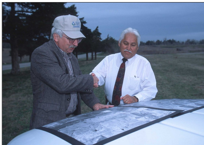
NRCS provides technical assistance for conservation planning at no cost to you.