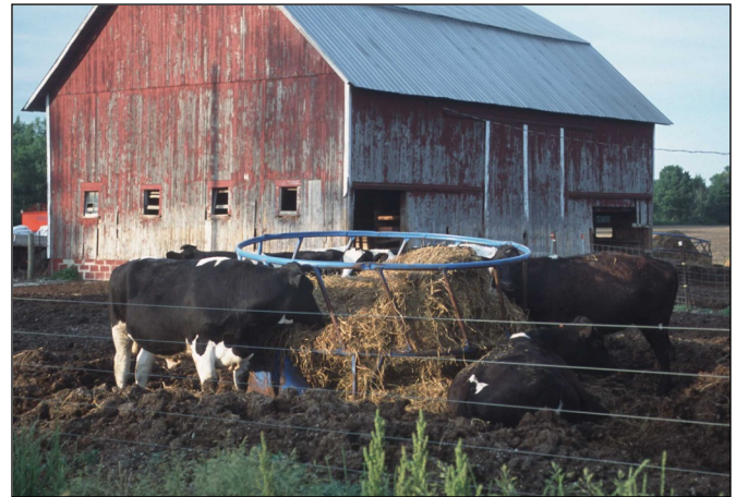
If manure is not being used for crop nutrients, then it is wasted money.