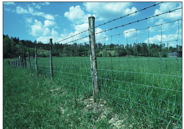
Goats can be difficult to control, good fences may be needed.