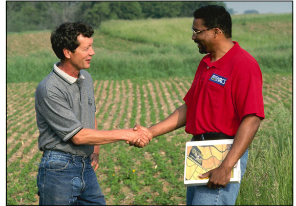
Helping People Help the Land

You may also be eligible to receive financial assistance, through a state or federal program. Your NRCS office will explain any programs that are available so you can make the best decision for your operation. All NRCS programs and services are voluntary.