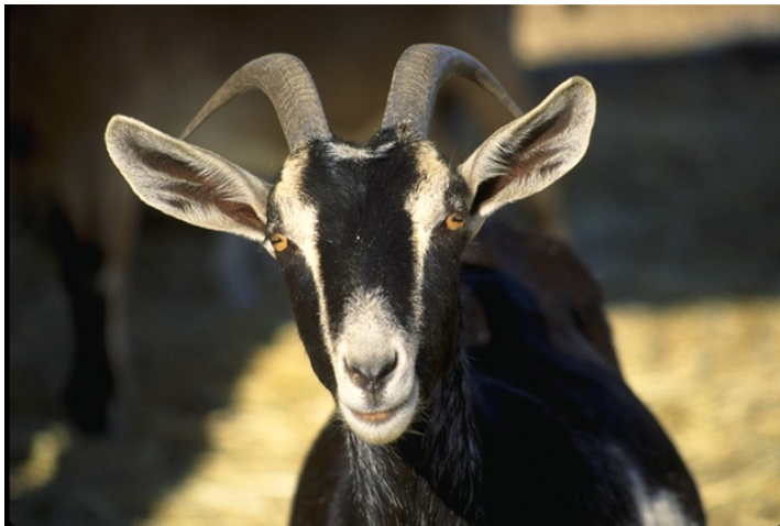
Goat health and nutrition are important considerations, particularly if goats will provide additional farm income