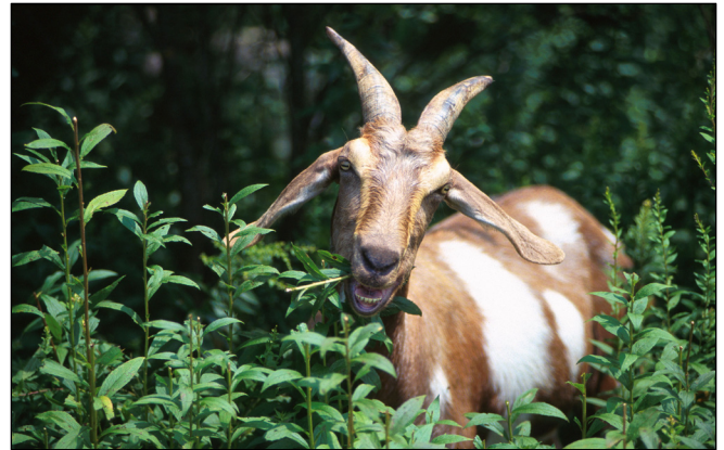
Goats can do a good job of controlling weeds and brush