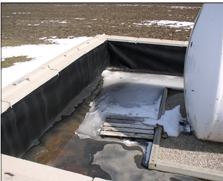
Prefab containment facility