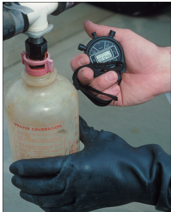
Calibrate equipment for correct application rates