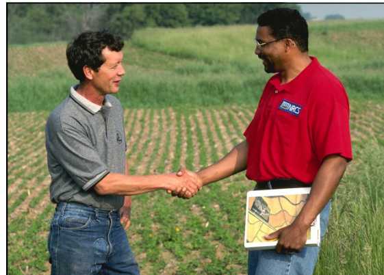
Helping People Help the Land

You may also be eligible to receive financial assistance, through a state or federal program. Your NRCS office will explain any programs that are available so you can make the best decision for your operation. All NRCS programs and services are voluntary.