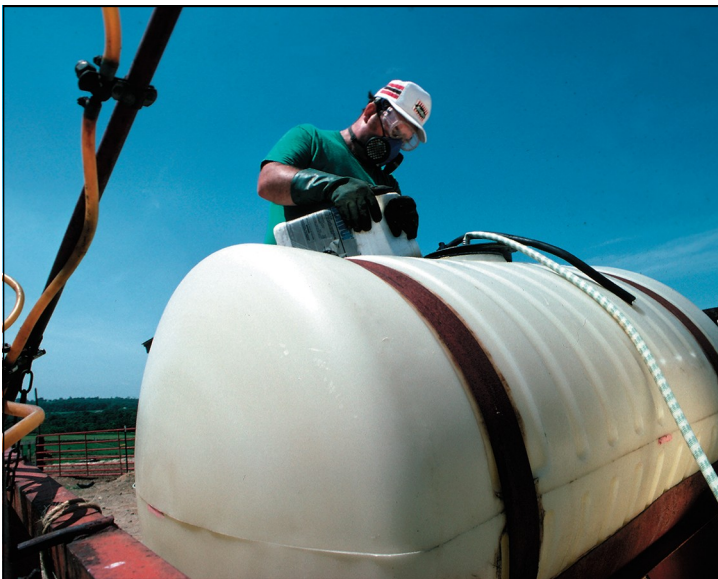
Protect workers and the environment from exposure to farm chemicals