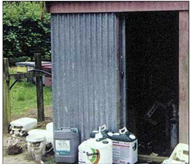
Unsafe pesticide storage due to poor management