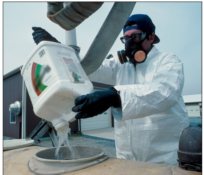
Use protective clothing when filling spray equipment